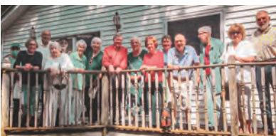
TCSF CLASS OF '55 REUNION