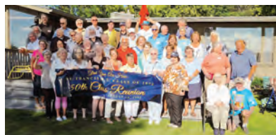
TCSF CLASS OF '75 REUNION