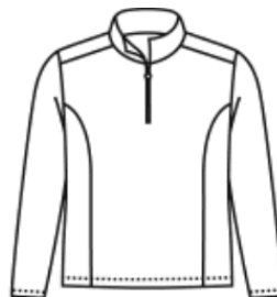
1/4 ZIP SPORT WICK PULLOVER Wear with collared shirt NAVY (9-12)