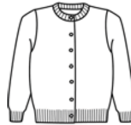
GIRLS CREW NECK CARDIGAN SWEATER Wear with collared shirt NAVY (K-12)