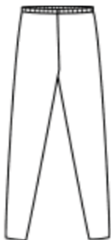
LEGGINGS Optional for layering for warmth or modesty See handbook for guidelines

Leggings and bike shorts are intended as layering items only and may not be worn alone.