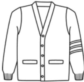
V-NECK W/ STRIPES NAVY W/WHITE (9-12) Wear with collared shirt and Varsity Letter if/when earned