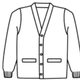
V-NECK CARDIGAN Wear with collared shirt NAVY (K-12)