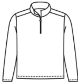
1/4 ZIP FLEECE PULLOVER Wear with collared shirt NAVY (K-12)