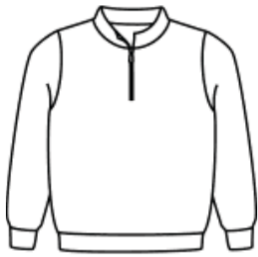
1/4 ZIP SWEATSHIRT Wear with collared shirt NAVY (K-12)

www.dennisuniform.com | 800.854.6951 WHEN ORDERING, BE SURE TO USE OUR SCHOOL CODE: HGT 1532 N. Opdyke Rd. #450, Auburn Hills, MI 48326