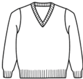
V-NECK PULLOVER Wear with collared shirt NAVY (K-12)