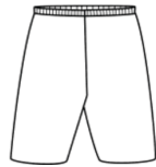
BIKE SHORTS Recommended for modesty when wearing skirts, shifts, dresses NAVY (K-12)

Leggings and bike shorts are intended as layering items only and may not be worn alone.