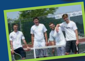
Friends & Family